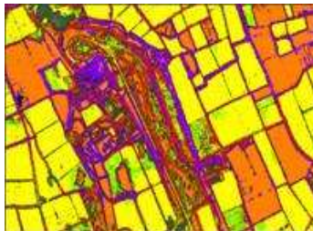
ISCI trained image of Pavia (crops, roads, trees)