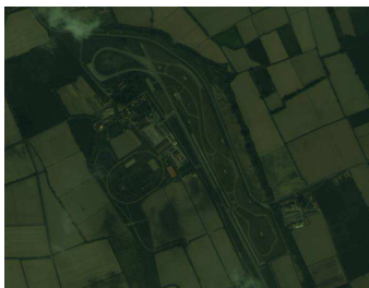
Satellite image of Pavia Italy